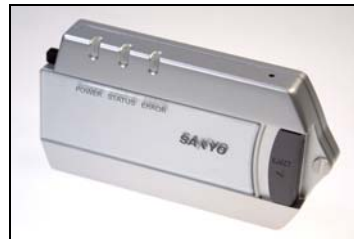
Optional Multi-Card Imager (POA-BOX20)

Because its products are subject to continuous improvement, SANYO reserves the right to modify product design and specifications without notice and without incurring any obligations.