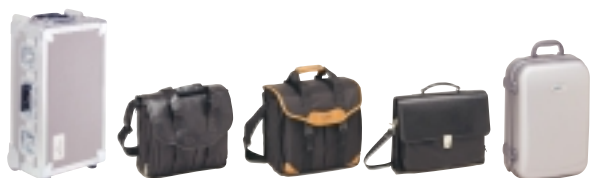
ATAPRO LT50DELUXE LT500TG LT50CASE LT50ROLLER