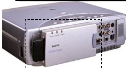
Optional Wireless Imager (POA-WL11) (Includes 1 wireless LAN card for projector)

Because its products are subject to continuous improvement, SANYO reserves the right to modify product design and specifications without notice and without incurring any obligations.