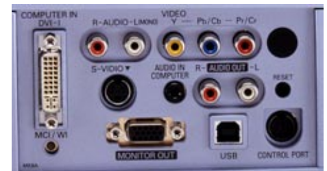
Input / Output Terminals