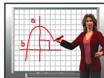
Black grid on a white background

You can overlay four types of lines, circles, and a world map (center city selectable) onto a blank screen or any projected image. This is handy for writing and drawing on whiteboards, etc. * Patent pending