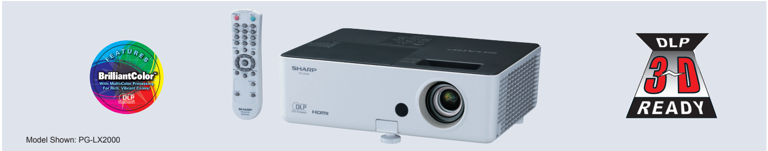
Model Shown: PG-LX2000

Portable and affordable, these 3D Ready BrilliantColor™ DLP® projectors deliver high image quality and superb reliability for classroom, meeting room and small office use. With 2,800 lumens and 2,000:1 contrast ratio, these models provide exceptionally vibrant and realistic image reproduction. The sealed DLP chip with filter-free design helps ensure low maintenance and operating costs. Built in an ISO 14001 certified factory with standby power consumption as low as 0.5W and estimated lamp life of up to 5,000 hours (in eco mode), these lightweight RoHS compatible projectors are an environmentally conscious choice.