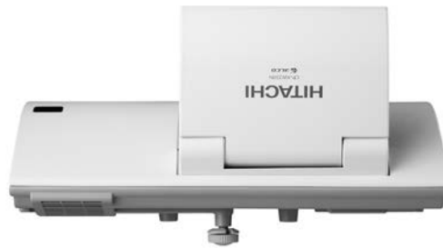
Front 3/4 View

AW312WN does it all in classrooms of all sizes. With 3,000 ANSI lumens brightness and WXGA 1280 x 800 resolution, the CP-AW312WN provides the perfect solution. It also features a high contrast ratio, long lamp life, cloning function enabling you to copy configuration settings from one projector to others of the same model, and is wireless presentation ready. Plus, embedded networking gives you the ability to manage and control multiple projectors over your LAN (scheduling of events, centralized reporting, image transfer, and email alerts). Best of all, the high performance CP-AW312WN is exceptionally reliable and offers a lower cost of ownership.