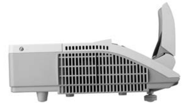
Right Side Profile