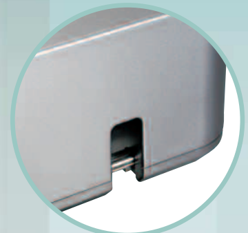
Anti Theft Security Bar

Legavisual.com Kft 3300 Eger Sz arvas G. u. 7 Tel: 36 36 510 500 Fax: 36 36 510 501 e-mail: info@legavisual.com www.legavisual.com