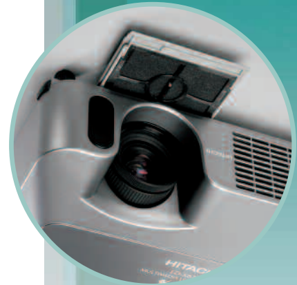
Easy Filter Access