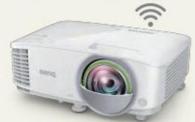
Short Throw EW800ST/ EX800ST