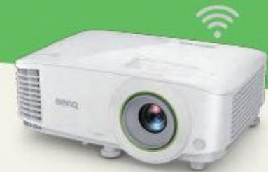
Standard Throw EH600/ EW600/ EX600