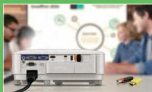
Hold Meetings "PC Free" to Stay Agile