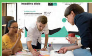
Instant Wireless Projection to Inspire Innovation