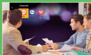
Business Apps at Your Fingertips for More Productivity