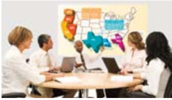
Give mobile presentations anywhere