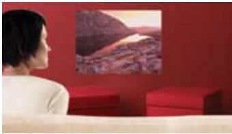
Watch movies with your friends