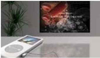
Couple with an iPod to play movies