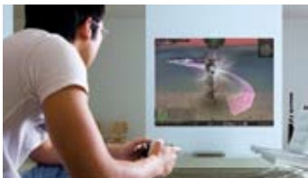
Play video games without a TV