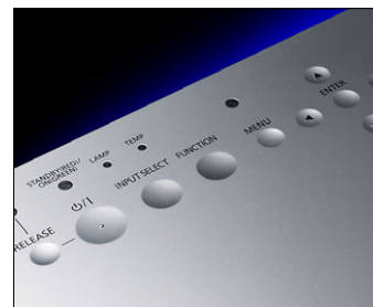
Touch-sensor controls on the top

The PT-LB78 enables excellent, long-term performance by minimizing the entry of dust into the unit.