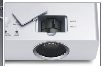
A zoom/focus ring cover and a lens cover